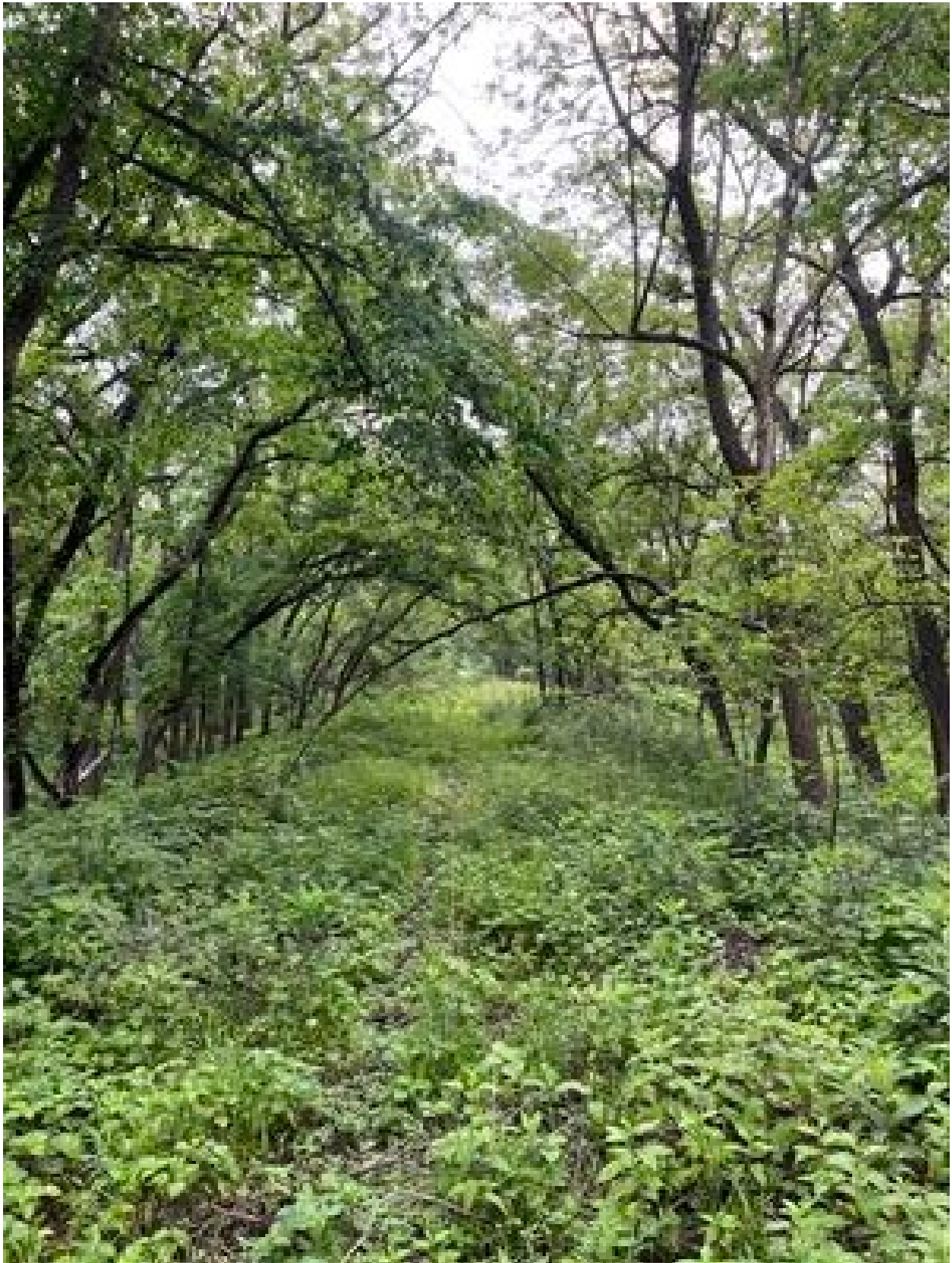
Typical trail condition