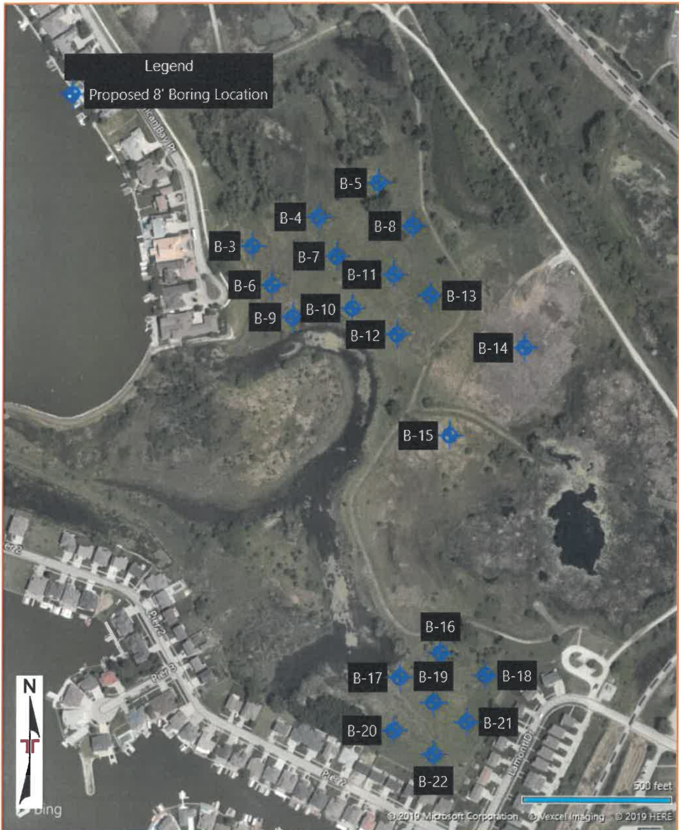
DIAGRAM IS FOR GENERAL LOCATION ONLY, AND IS NOT INTENDED FOR CONSTRUCTION PURPOSES

November 13, 2019 ■ Terracon Project No. PA3195110rev