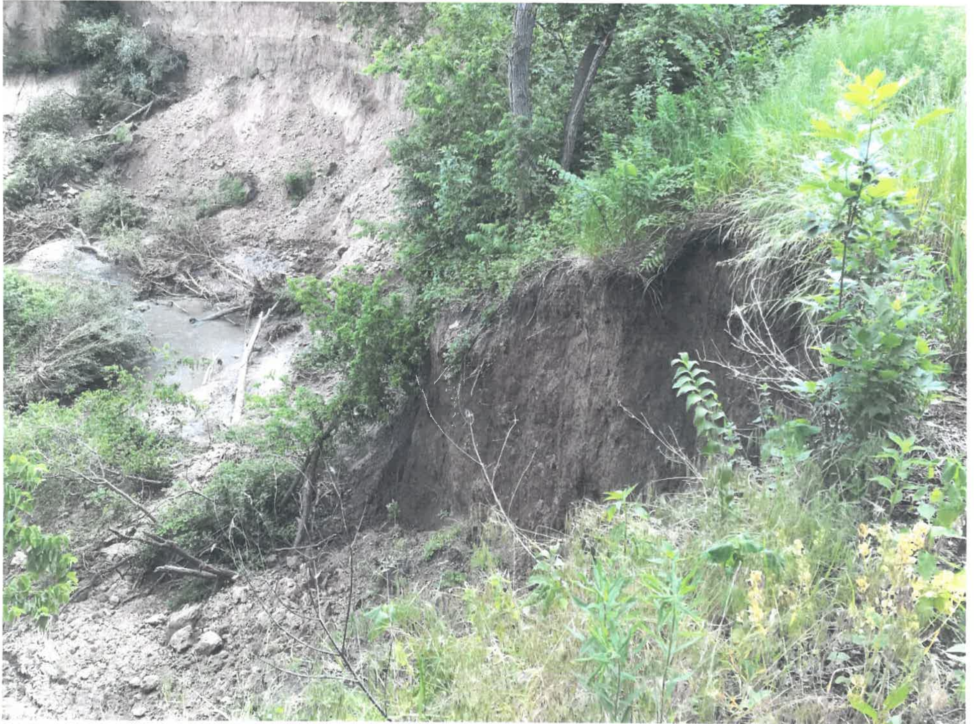
Oak Creek Trail 1.25 miles west of Valparaiso