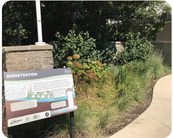
Bioretention area, Lincoln Children's Zoo