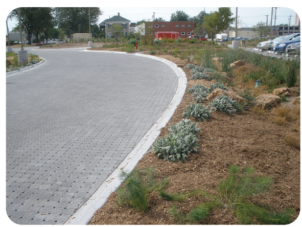
Pervious pavment and bioswale - Antelope Valley