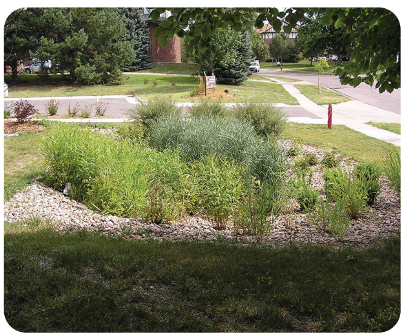
Rain garden, LPSNRD office