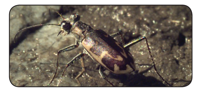
Salt Creek Tiger Beetle

Saline wetlands are characterized by the levels of salinity found in the soil. Plants and animals that live in the wetlands are specially adapted to the salty conditions, creating one of the earth's most rare ecosystems. This unique phenomenon is thought to be a result of salt deposits in the ground left by seas that once covered the area. Although it is estimated that 20,000 acres of saline wetlands once existed, that number is down to less than 4,000 acres. Most people have little to no knowledge of the natural habitat and are therefore destroying existing wetlands through development. This makes conservation efforts all the more important. The saline wetlands kept by the Lower Platte South NRD are home to two endangered species shown below.