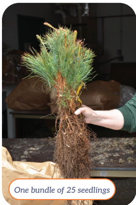
One bundle of 25 seedlings

Need instruction on planting your tree seedlings? Visit: