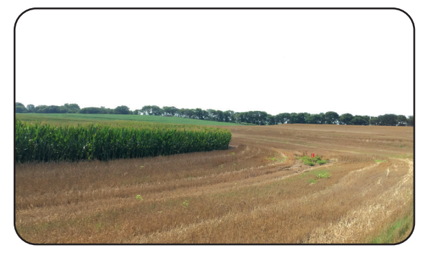
Terrace with riser in wheat field