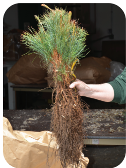
One bundle of 25 seedlings

Need instruction on planting your tree seedlings? Visit: