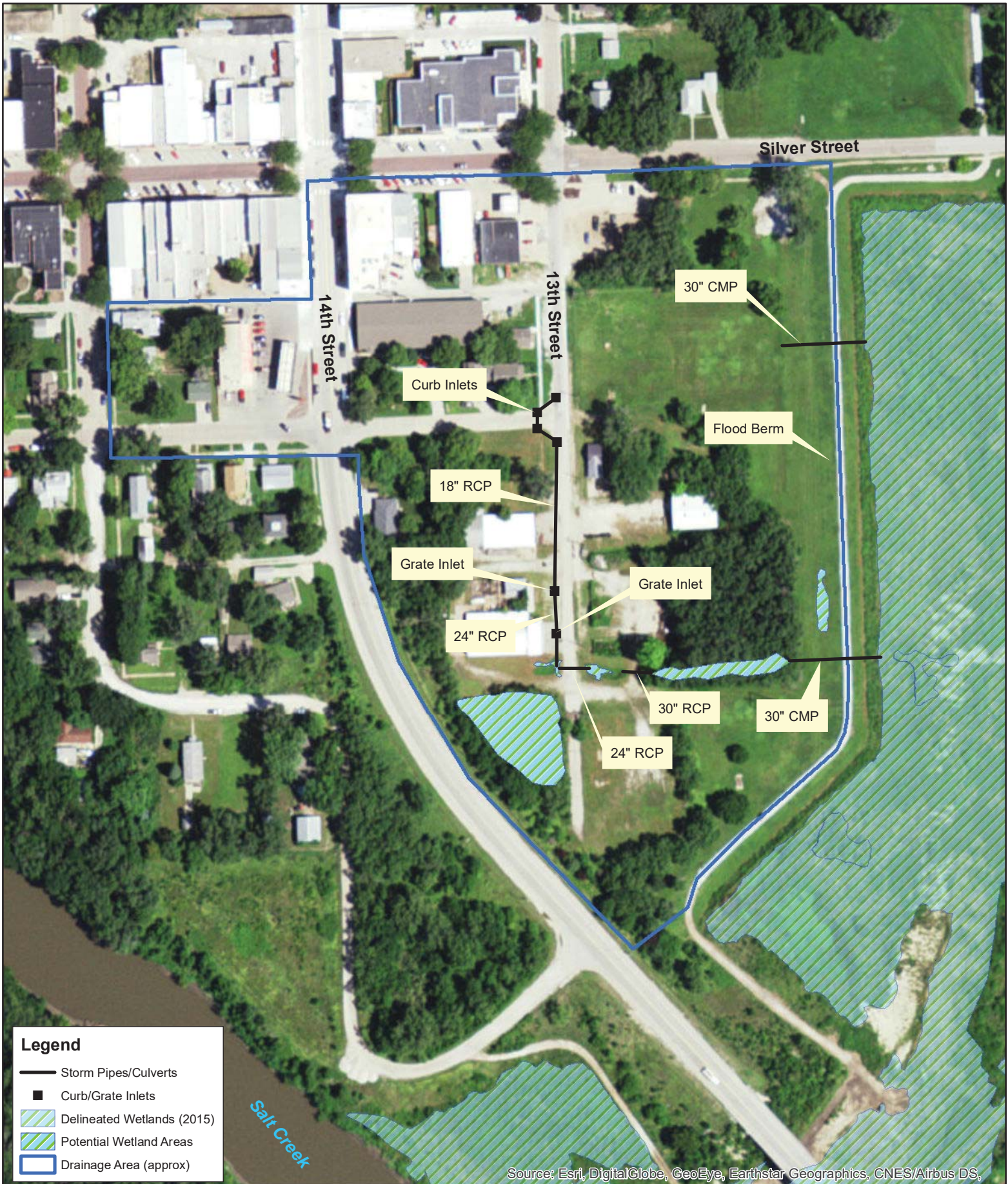
Figure 1 - Study Area Map

Drainage Evaluation - Project # R170318 Ashland, Nebraska