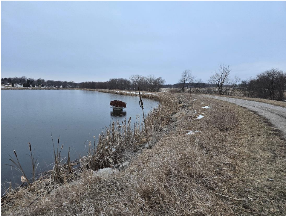
Figure 1: Spillway Riser and Top of Dam (JEO Site Visit, February 25, 2026)