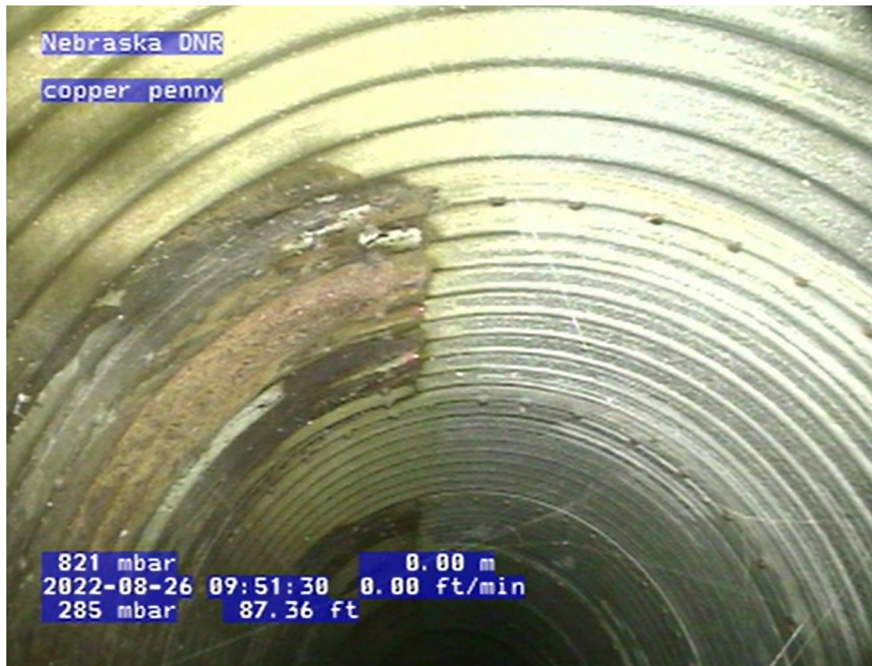
Figure 3: Typical Corrosion of Principal Spillway Pipe Wall (DWEE CCTV, August 26, 2022)