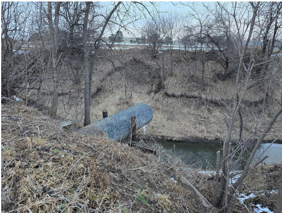
Figure 2: Spillway Outfall (JEO Site Visit, February 25, 2026)