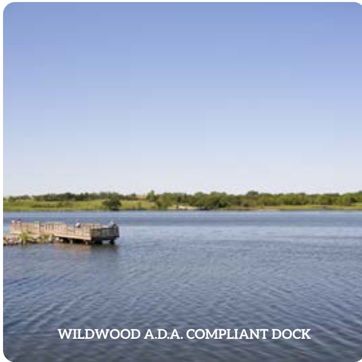
WILDWOOD A.D.A. COMPLIANT DOCK

The NRD lakes are great places for almost any favorite outdoor activity; fishing, hunting, camping, hiking, birding, or just relaxing. The NRD maintains about 180 flood control dams throughout the District. Eight of the largest flood control dams have also been developed for public recreation. No permits are required for entry, but Nebraska hunting and fishing licenses are required for those activities. Any special regulations are posted at each entrance.