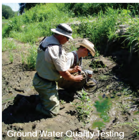
Ground Water Quality Testing

Formed by watershed boundaries in 1972 by the Nebraska Legislature, there are 23 NRDs across the state of Nebraska. Unique to our state, the NRDs were created to provide local control for the management and protection of natural resources. Here is a sampling of what your NRD does for you!