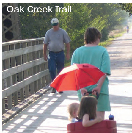
Oak Creek Trail