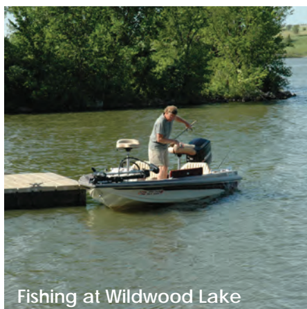
Fishing at Wildwood Lake

*Please note, a "Know Your NRD" Fact Sheet has been included with your Resource Corner. Check it out to learn more about the projects and programs your NRD is involved with.