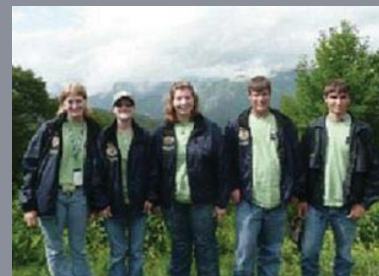
Nebraska 2009 State Envirothon Champions from Ord, NE. Pictured at the Envirothon National Competition in the Smokey Mountains.